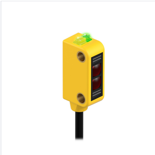
Q12AB6FF50Q5-81078 4 PIN EURO 500MM Part Number: 81078

ALERT: This part is obsolete. Contact Banner Engineering for information about selecting a suitable replacement.